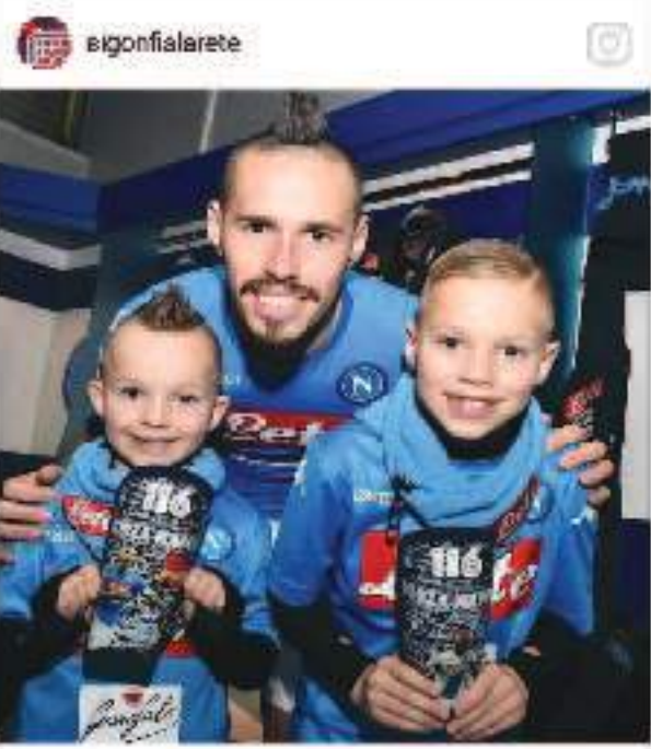
sigonfiarete Super #Hansak! Chi vorrebbe incontrarlo? Tagga un amico e so-ego perchè. 🍷